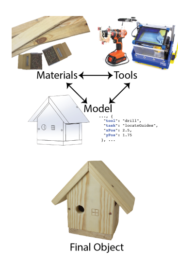
Figure 1: Drill Sergeant allows tools, materials, and model specifications to inform and define each other as a user works to create a final object.

dimensions, composites, fasteners, etc.) and an ecosystem of tools to craft physical artifacts. Novices become proficient in working with these different tools and materials through tutorials published in books, e.g. [10, 15], and online, e.g. [2]. These tutorials today are static, pre-recorded media, leaving builders with a non-trivial translation of written steps into corresponding actions [17]. Inspired by the techniques of interactive software tutorials, we seek to augment physical DIY projects by providing in-situ step instructions and progress tracking [3]; generate dynamic feedback on technique [9]; and adapt tutorial content to a user's specific context and preferences [4] (see Figure 1). We aim to achieve these goals by augmenting a set of power tools with sensing, communication, and local user interfaces for continuous task feedback. We develop a novel instruction format describing how tools should be used to fabricate a model out of raw materials and a framework to delegate instructions to appropriate tools in sequence.