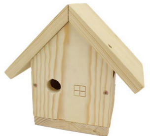
Figure 6: We created example objects to test the utility of our tools: a box with beveled joinery (top) and a birdhouse with peaked roof (bottom).