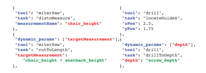
Figure 4: Our JSON-based language has dynamic and static parameters for instructions; formulas are evaluated in Python. This language captures all tasks, from measuring a dimension and cutting to length on a saw (left) to locating and drilling in the correct location (right).

We model step-by-step instructions for woodworking assemblies in a JSON file format. Each assembly file consists of an ordered list of steps containing recording tool and task, for all steps, alongside task-specific parameters (see Figure 4). Task parameters may also be