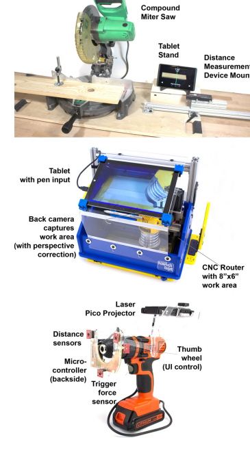
Figure 3: Augmented miter saw (top), augmented CNC router (middle), augmented drill (bottom).

The essence of each augmented power tool is a commodity tool augmented with sensors and/or a display. We focus on tasks that require precision and may be hard to judge by eye or measure with conventional tools, e.g., ensuring a drill is exactly perpendicular to a workpiece.